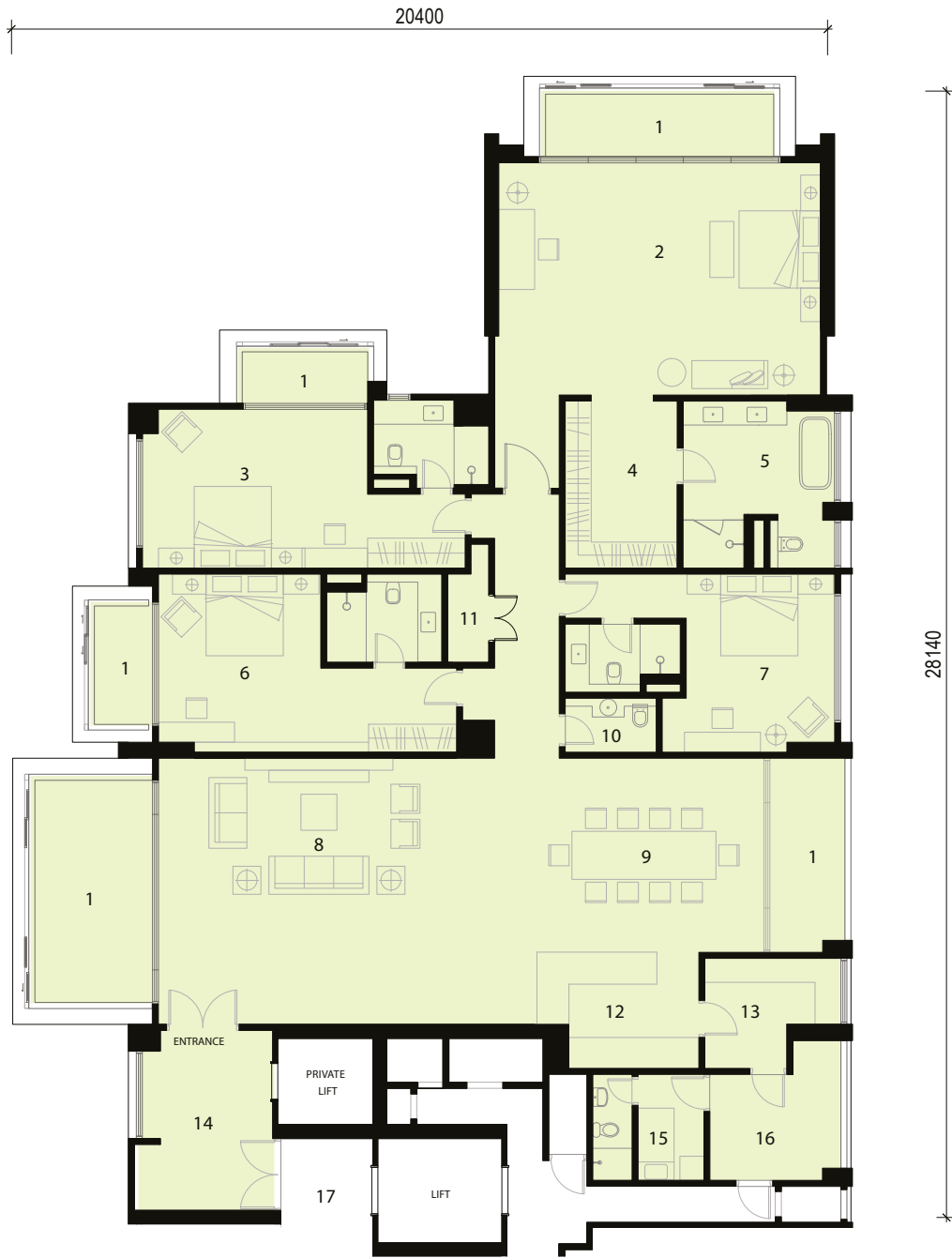
{ TYPE B2 } 4+1 Bedroom Unit 399 m2 (4,293 sq. ft.)